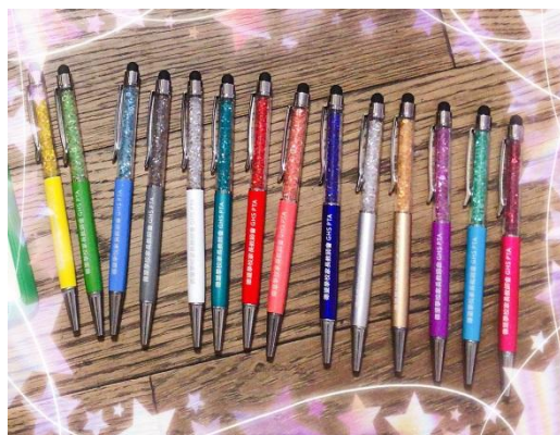
Crystal Ball Pen Stylus Screen Touch 水晶觸屏筆